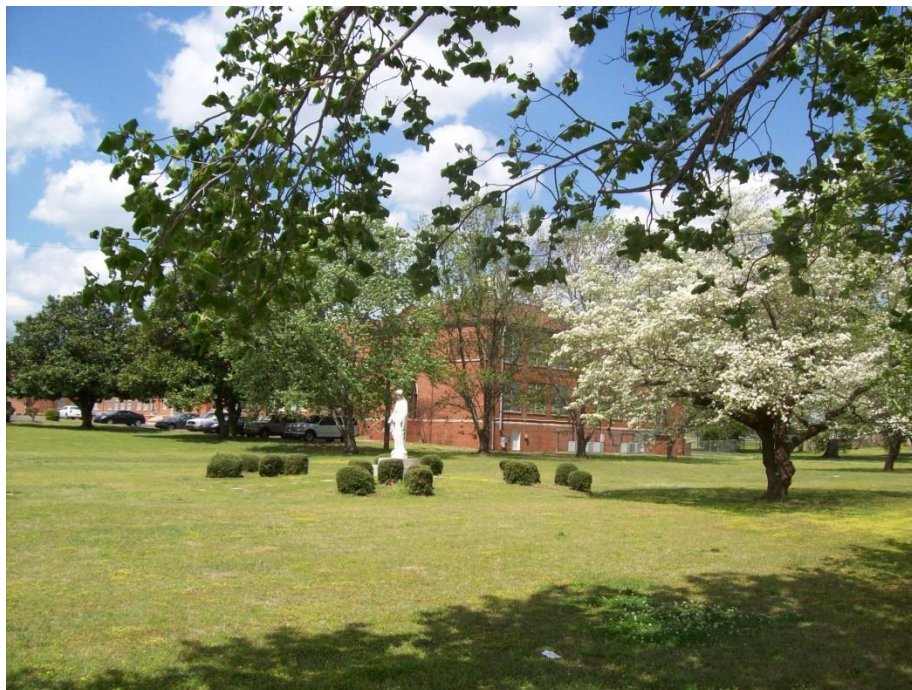
THE SERENE GROUNDS OF THE CITY OF ST. JUDE IN SPRING 2013.