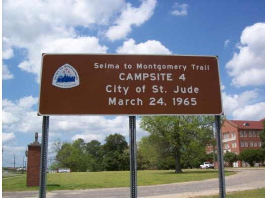
THE SELMA TO MONTGOMERY TRAIL – DESIGNATED AS NATIONAL HISTORIC TRAIL