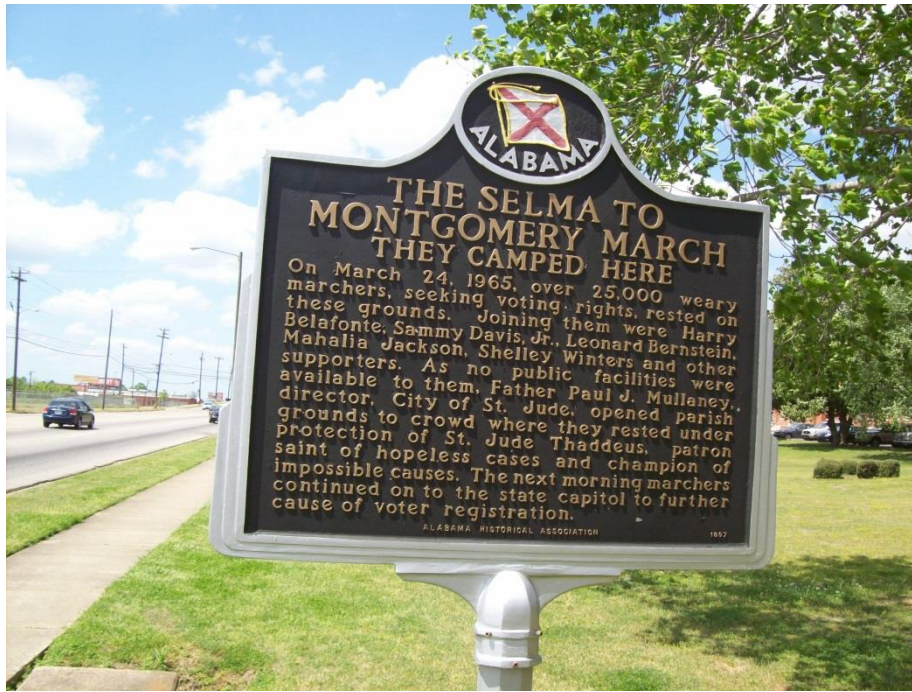
LAST CAMPSITE ON THE SELMA TO MONTGOMERY MARCH. NEXT AND LAST STOP THE CAPITOL BUILDING