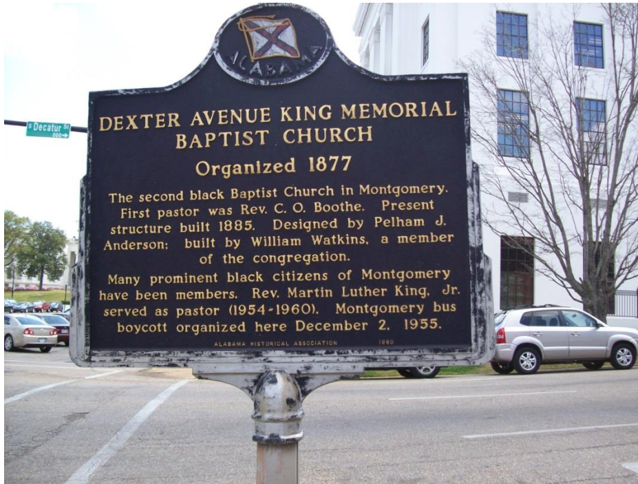
DEXTER AVENUE BAPTIST CHURCH – WHERE THE MONTGOMERY BUS BOYCOTT WAS BORN