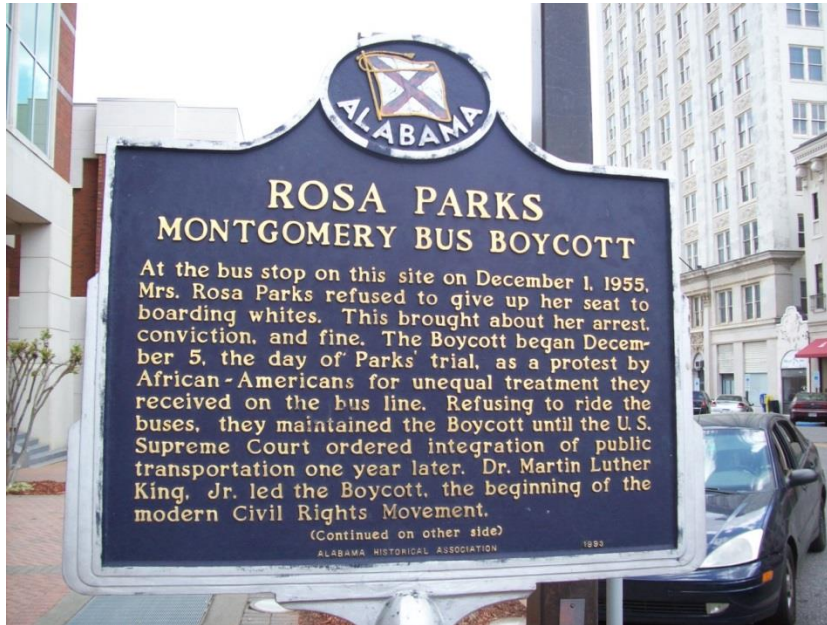
I love the signs with the Alabama flag on top commemorating historical events throughout the state.