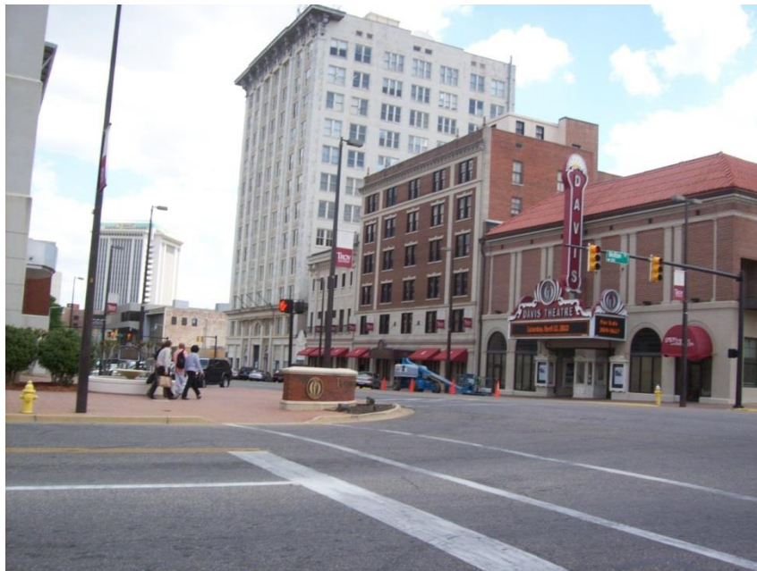
"THE CORNER" WHERE THE BUS STOPPED On 12/1/1955, AND ROSA PARKS IGNITED THE SPARK THAT CHANGED THE WORLD.