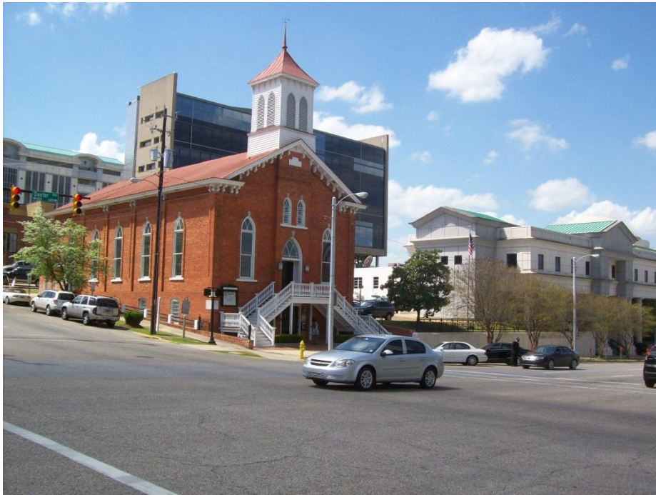
DR. MARTIN LUTHER KING, JR. WAS THE PASTOR OF THE DEXTER AVENUE BAPTIST CHURCH. IN THIS CAPACITY, HE BECAME THE LEADER OF THE MONTGOMERY BUS BOYCOTT. IF THE DRIVER OF THE SILVER CAR IN THE ABOVE KEEPS GOING STRAIGHT, HE OR SHE WOULD COME TO THE CAPITOL BUILDING IN ABOUT TWO BLOCKS. THE SELMA TO MONTGOMERY MARCH ENDED AT THE CAPITOL BUILDING.