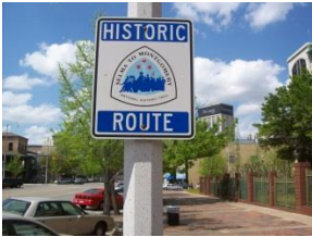
THE SELMA TO MONTGOMERY NATIONAL HISTORIC TRAIL WINDS THROUGH NEIGHBORHOODS AND DOWNTOWN MONTGOMERY