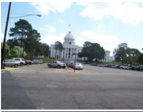
THE SELMA TO MONTGOMERY VOTING RIGHTS MARCH ENDS AT THE STATE CAPITOL BUILDING

FOR JOINING ME ON THE PICTORAL TOUR OF THE HISTORICAL SIGHTS OF MONTGOMERY! I GET GOOSE BUMPS WHEN I STAND IN SPOTS WHERE THE COURSE OF HISTORY CHANGED...LIKE THE CORNER WHERE ROSA PARKS REFUSED TO GIVE UP HER SEAT OR THE DEXTER AVENUE BAPTIST CHURCH. HOPE Y'ALL ENJOYED PICTURE JOURNEY! HOPE Y'ALL CAN SEE THESE SIGHTS IN PERSON SOMEDAY!